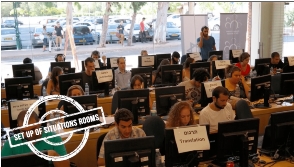
Screenshot from video promoting the project, posted on the Combined Jewish Philanthropies of Greater Boston website.

The Forward predicts: “Initiatives in cyberspace seem likely to increase.”