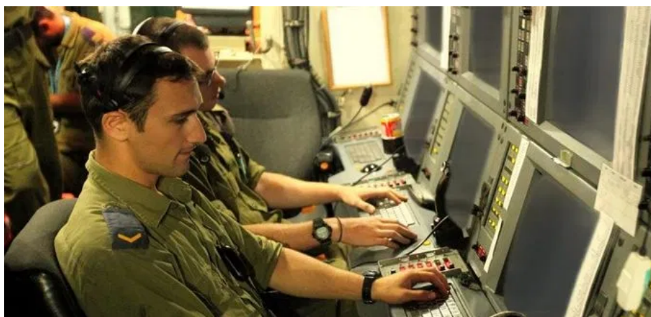
Photo from article about Unit 8200 on Britain Israel Communications and Research Centre website .

Another Israeli entity that plays a role in covert Internet activity is the Israeli military's legendary high-tech spy branch, Unit 8200 . This unit is composed of thousands of "cyber warriors" primarily 18 to 21 years of age; some even younger. A number of its graduates have gone on to top positions at tech companies operating in the U.S. , such as Check Point Software (where the spouse of the Jewish Voice for Peace head is employed as a solutions architect).