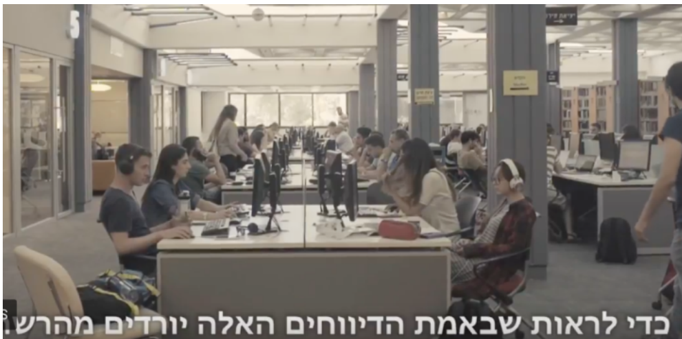
Screen shot from a video about student program to spread pro-Israel content on the Internet and social media.

Another project to do battle on the Internet was initiated in 2011 by the 300,000-strong National Union of Israeli Students (NUIS). The goal was “to deepen and expand hasbara [state propaganda] activities of students in the State of Israel.”