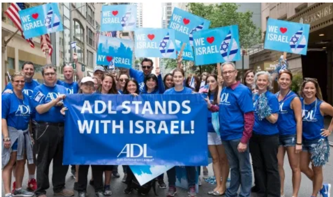
Anti-Defamation League celebrates Israel at 2017 New York City parade.

Given the record of infiltration and orchestrated activities described above—many financed by a combination of certain influential billionaires and the Israeli government itself—it’s hard to imagine that Israeli organizations and partisans are not thoroughly embedded in this program. In fact, one of the NGOs already working with YouTube as a “trusted flagger” is the Anti-Defamation League , whose mission includes ‘standing up for Israel.’