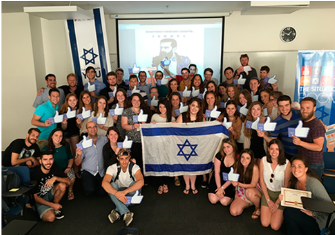
Photo of group that participated in Act.il training

The Forward reports: “Act.il says that its app has 12,000 sign-ups so far, and 6,000 regular users. The users are located all over the world, though the majority of them appear to be in the United States. Users get ‘points’ for completed missions; top-ranked users complete five or six missions a day. Top users win prizes: a congratulatory letter from a government minister, or a doll of David Ben-Gurion, Israel’s founding prime minister.”