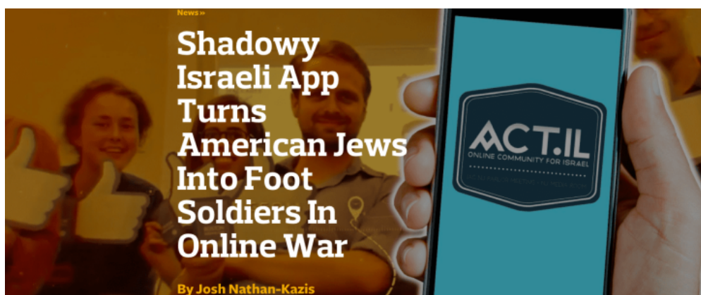
Title image from Forward article about the Act.IL campaign.

In 2017 yet another project to target Internet platforms was launched. Known as Act.il , the project uses a software application that "leverages the power of communities to support Israel through organized online activity."