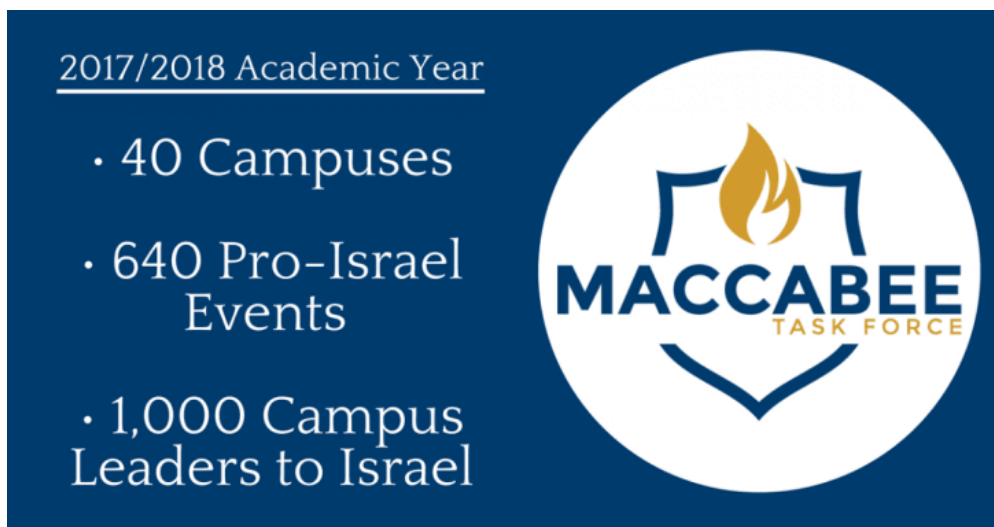
Image from Maccabee end of year report .

In addition, the project is supported by Israel's Strategic Affairs Ministry and Israel's intelligence community. Its CEO is an eight-year veteran of Israeli army intelligence.