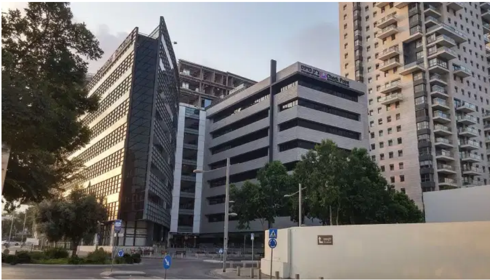
Check Point Software headquarters in Tel Aviv. Founded by a former Unit 8200 member, it also has offices throughout the U.S. Israeli tech companies sometimes assist in online spying efforts.

Numerous Israeli tech companies, many of them headed by former military intelligence officers, assist in these online spying efforts, sometimes receiving Israeli government funding “for digital initiatives aimed at gathering intelligence on activist groups and countering their efforts.”