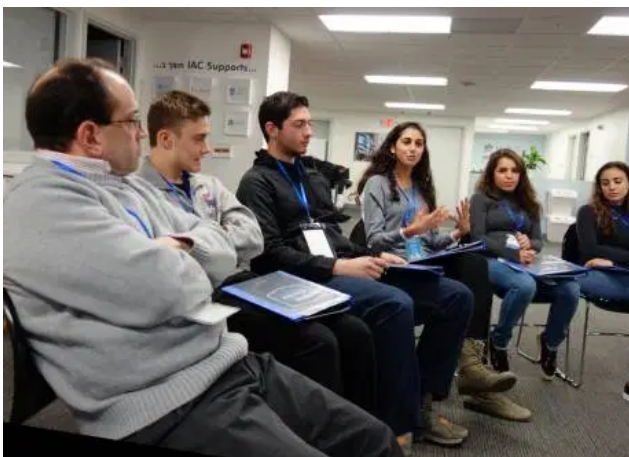
New Jersey “Media Room,” a project of IAC New Jersey in partnership with Act.il.