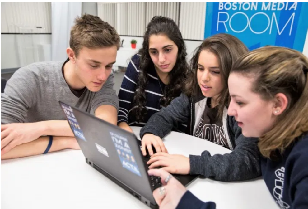
Photo of Boston Media Room published by Combined Jewish Philanthropies of Greater Boston, which states : “Media Room Ambassadors are students and adult mentors who are trained with the knowledge, skills, and tools to positively influence public discourse by developing pro-Israel social media campaigns.”

The Forward reports: “In November, the Boston media room created a mission for the app that asked users to email a Boston-area church to complain about a screening there of a documentary that is critical of Israel. The proposed text of the email likens the screening of the film to the white supremacist riot in Charlottesville, Virginia, and calls the film’s narrator, Pink Floyd frontman Roger Waters, a ‘well-known anti-Semite.’”