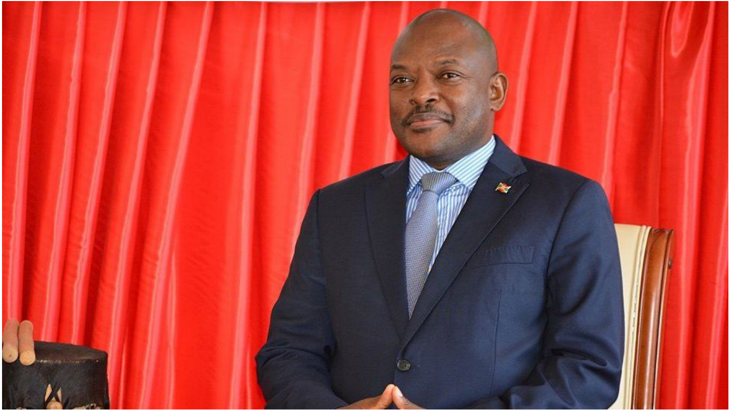
In Tanzania, it was President John Magufuli