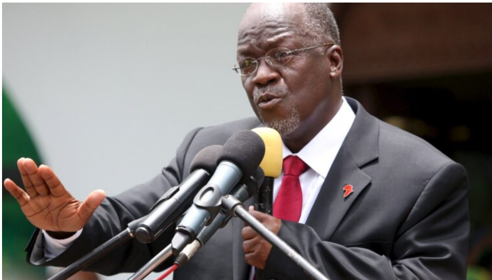
In Haiti, it was President Jovenel Moïse