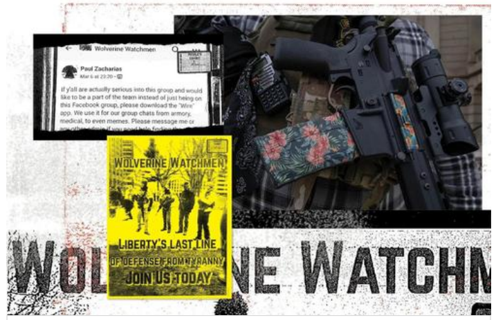
Exhibits from hearings in the case include screenshots of chats and flyers handed out by the Wolverine Watchmen. A boogaloo boy (top right) holds a rifle at a rally at the Michigan state Capitol in Lansing in October 2020.

Three weeks later, over a dozen men were arrested by federal and state agents in what one federal prosecutor described as a "deeply disturbing" criminal conspiracy hatched over several months via secret meetings, encrypted chats, and paramilitary-style training exercises.